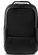
DELL PREMIER BACKPACK 15 | PE1520P

Protect your laptop with this sleek and stylish leather sleeve made from 50% recycled materials 25 .