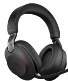
JABRA EVOLVE2 85

Multi-task seamlessly across 3 devices with this premium full size keyboard and sculpted mouse combo with programmable shortcuts and 36 months battery life 28 .