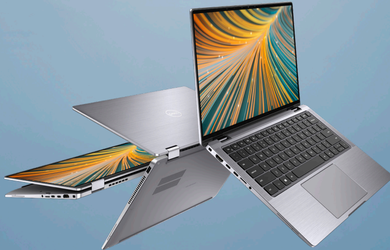
Configurable as a laptop or 2-in-1