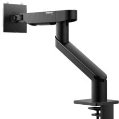
DELL SINGLE MONITOR ARM | MSA20

Keep your desk clutter free with this World's first monitor arm that offers swivel angle adjustment with a flip of a switch 27 and can also be easily assembled and installed.