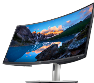
DELL ULTRASHARP 38 CURVED USB-C HUB MONITOR | U3821DW

Keep your desk clutter free with this World's first monitor arm that offers swivel angle adjustment with a flip of a switch 27 and can also be easily assembled and installed.