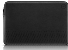
DELL ECOLOOP LEATHER SLEEVE 14 | PD1422VL

Easily take notes and stay organized whether in meetings or on the go.