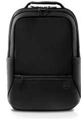
DELL PREMIER BACKPACK 15 | PE1520P

Protect your laptop with this sleek and stylish leather sleeve made from 50% recycled materials 25 .