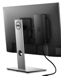
DELL DOCKING STATION MOUNTING KIT | MK15

This comprehensive dual monitor and system mounting solution keeps your desk clutter free. It is the world's first monitor arm that offers swivel angle adjustment with a flip of the switch 27 .