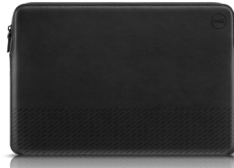
DELL ECOLOOP LEATHER SLEEVE 15

Easily take notes and stay organized whether in meetings or on the go.