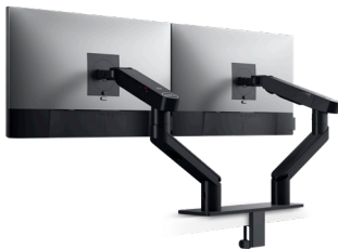
DELL DUAL MONITOR ARM | MDA20

Long lasting rechargeable mouse with a battery life of up to 6 months on a full charge 26 .