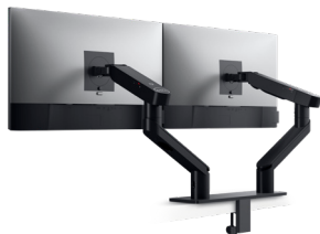
DELL DUAL MONITOR ARM | MDA20

Easily attach your Dell Dock to the Dell Dock Mounting Kit and mount it behind a monitor, to a wall or under the desk for a clutter-free workspace.