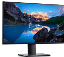
DELL ULTRASHARP 27 4K USB-C MONITOR | U2720Q

Work at full speed with Dell's powerful Thunderbolt Dock. Charge your system faster, support up to two 4K displays and connect to your peripherals via a single cable.