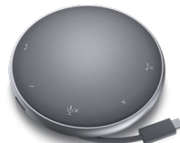
DELL MOBILE ADAPTER SPEAKERPHONE | MH3021P

This comprehensive dual monitor and system mounting solution keeps your desk clutter free. It is the worlds first monitor arm that offers swivel angle adjustment with a flip of the switch 26 .