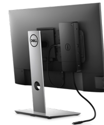
DELL DOCKING STATION MOUNTING KIT | MK15

Experience true color and striking clarity on this 27" 4K monitor with a wide color coverage. Features VESA DisplayHDR™ 400, InfinityEdge and USB-C connectivity with up to 90W power delivery.