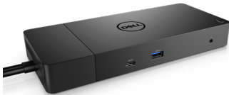
DELL THUNDERBOLT DOCK | WD19TB

Work at full speed with Dell's powerful Thunderbolt Dock. Charge your system faster, support up to two 4K displays and connect to your peripherals via a single cable.