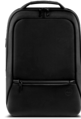
DELL PREMIER SLIM BACKPACK 15 | PE1520PS

Easily take notes and stay organized whether in meetings or on the go with the rechargeable active pen. Wirelessly charges to 100% within 30 seconds while garaged in the keyboard, so it stays with you.